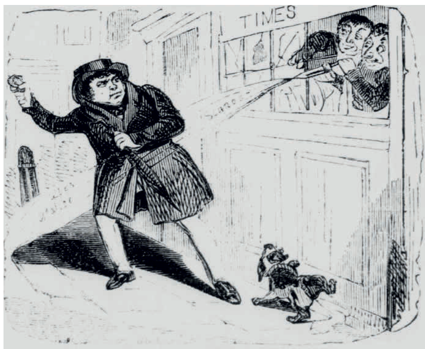
Fig. 1. "Sign of 'The Times'", Figaro in London , 01.10.1936, 5 (252), p. 161